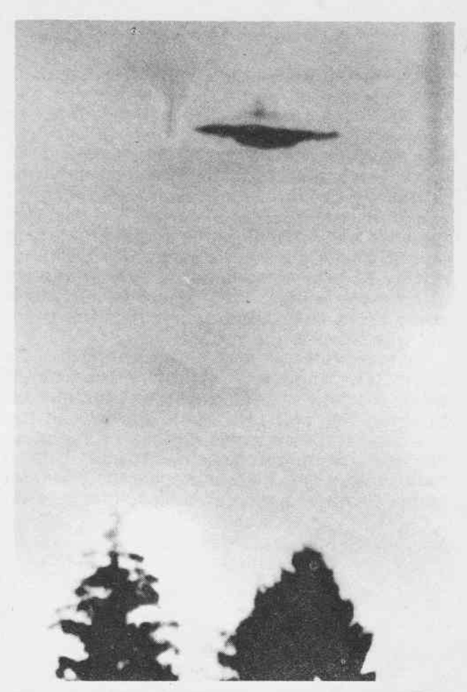
This was the first shot of Semjase's extraterrestrial vehicle, taken by Eduard Meier, just after sighting the UFO.

began to hear the humming sound again. Suddenly the strange craft shot in from the East and circled over the woods as it slowed down. As the humming diminished this time I understood the strange behavior of the animals. Evidently they had somehow become aware of the presence before it appeared overhead. The object curved over the trees towards the clearing and settled gently on the grass. I hurriedly snapped another picture as it was coming down. It was 2:31. It made its landing softly and without a stir near the trees. As soon as it landed, I, full of curiosity, ran toward it to get closer and possibly photograph it then. But, about 100 meters from the object, I was